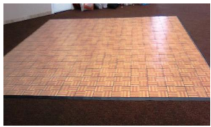
(right) Indoor Installation