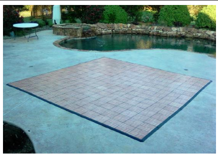
Back Yard Patio Installation