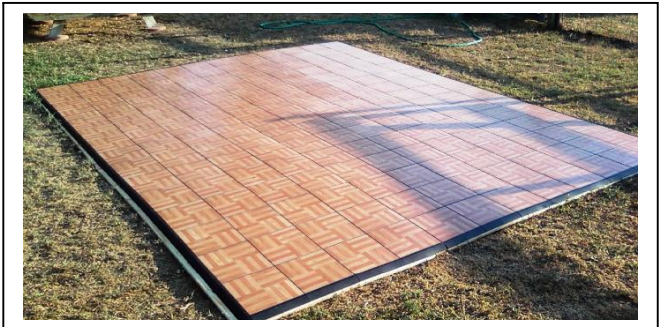
Back Yard Installation on Grass with Subfloor