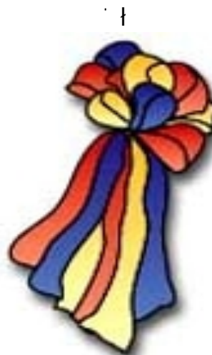
Step C Finished Crepe Rosette

&I<G< 08G<I IFJ<K<J D 8B< 8EP : FIE<I F=K< IFFD ƒFB K<I@@// I PFL : 8E LJ< Kƒ ; <: F18K< K< 9L=<Kf: 8B< K89G< "G@ FEKƒ : FIE<IJ F=K89G< : ƒKƒ FI 8I18E>> 8IFLE; : 8B< ˘ G@ FE : LIK@J˘ LJ< N @ 98ƒFE : ƒJK<IJ 8E; 98EE<IJ/ 7FL D 8P LJ< N @< J8K@ I@9FE Kƒ D 8B< IFJ<K<J˘ 8J N <ƒ