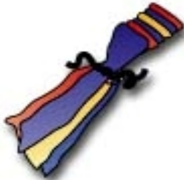
Step B Tie Rosette