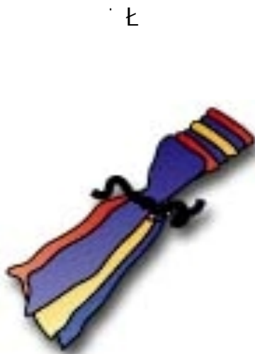
Step B Tie Rosette