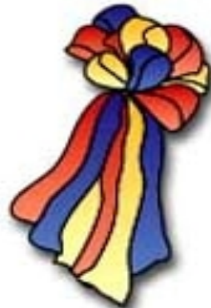
Step C Finished Crepe Rosette

Crepe Paper rosettes make any corner of the room look terrific. Or you can use to decorate the buffet/cake table (pin onto corners of table cloth or arrange around cake), pin on curtains, use with balloon clusters and banners. You may use wide satin ribbon to make rosettes, as well.