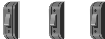
Mixing Auger Freeze Refrigerate